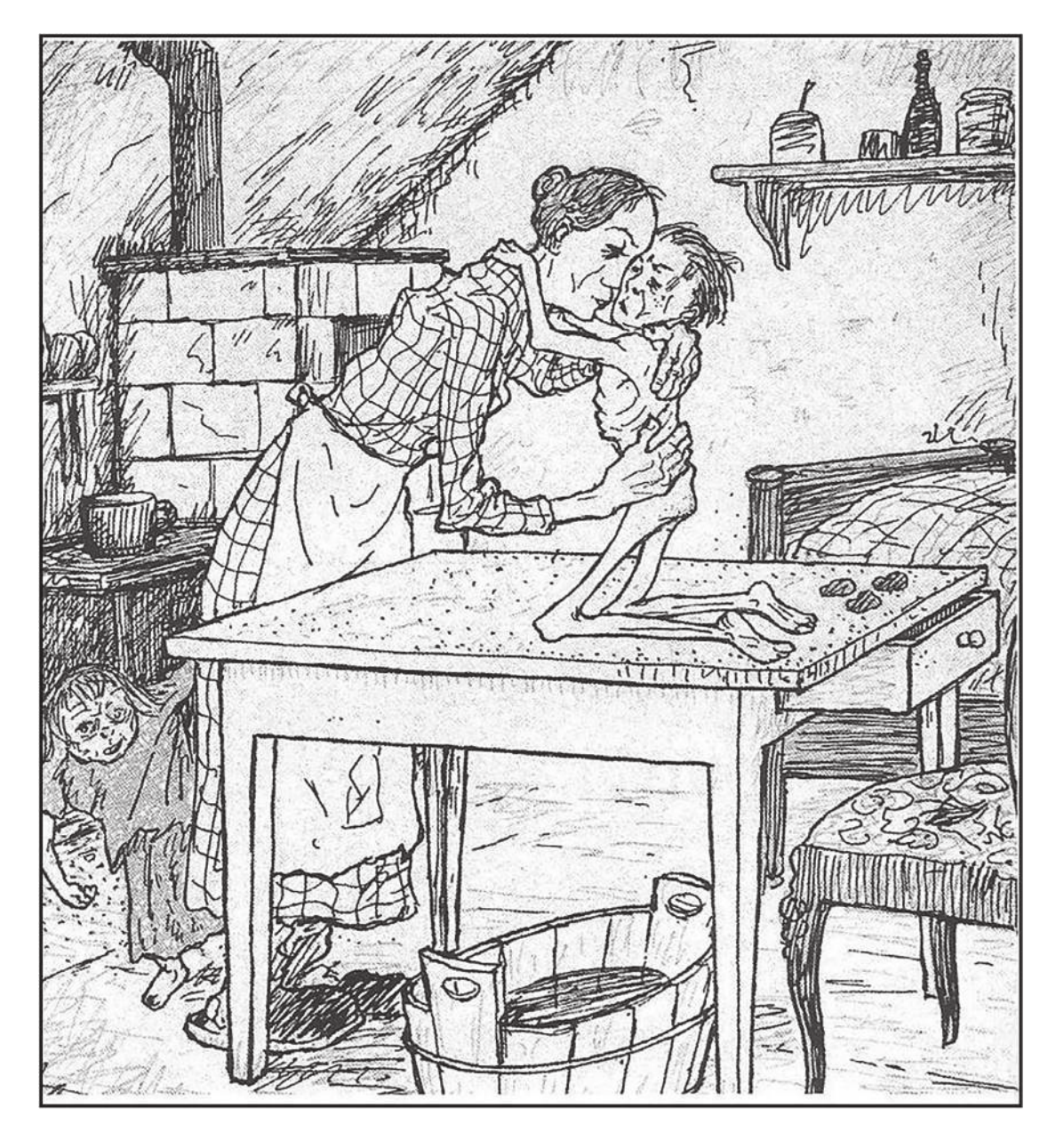
A cartoon entitled 'Consolation' published in a German magazine, 24 June 1919. The mother is saying to her child, 'When we have paid 100,000,000,000 marks, then I shall be able to give you something to eat.'